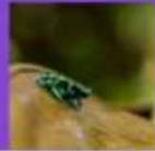
Poison dart frog